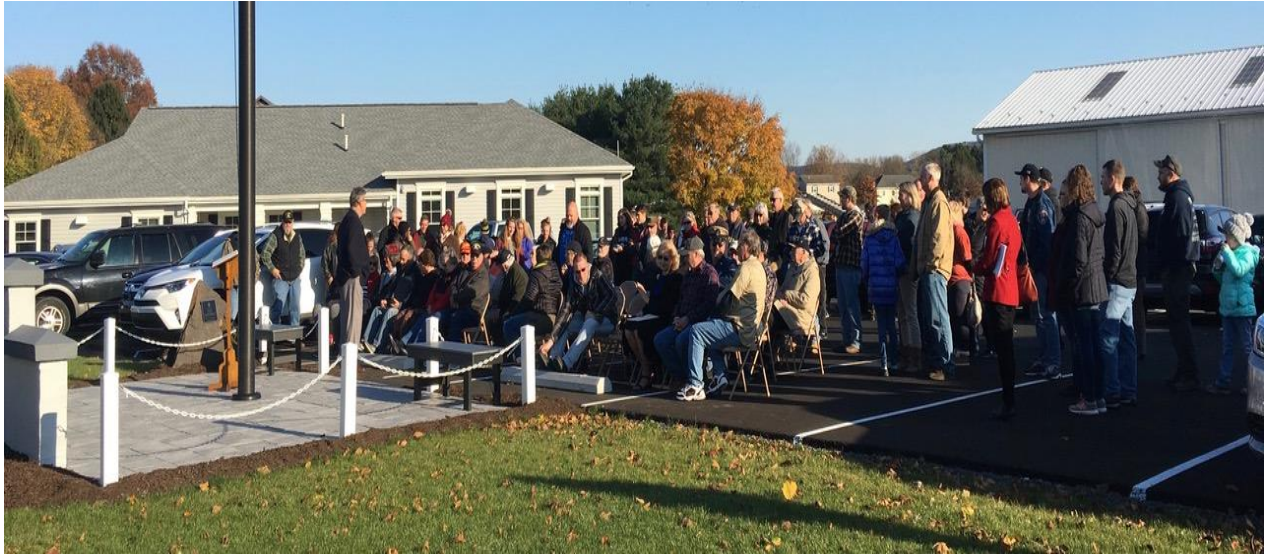
Veteran's Memorial Dedication held on 11-11-18.

Upper Paxton Township 506 Berrysburg Road Millersburg, PA 17061